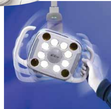
A-dec LED's three-axis, spherical rotation makes every movement fluid and ultra-precise.

Low Power, No Bulbs, Low Heat, No Noise. When it comes to cost of ownership, think low —and ecologically smart: the A-dec LED consumes 80% less power than halogen lights, with a life expectancy of 20 years. All without ever having to change a bulb. And because it doesn't emit heat or require a fan for cooling, it's both comfortable and quiet.