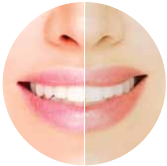
High CRI Lower CRI

By producing a color rendering index (CRI) of 90 at 5,000K, the A-dec LED mimics nature. Observe the difference when compared to less refined LED operatory lights with a lower CRI.